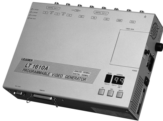
LT 1610A, LT 1611, LT 1612A (LT 1610A shown)

This group of three RGB generators offers dedicated analog, digital or combined analog/digital outputs to best suit application needs. Dot clock frequencies handle a wide range of applications ranging to SXGA (1200 x 1024). All in the group operate from user-replaceable ROMs making them ideal for production operations wherein parameters are not to be altered by operators. Remote control units (LT 1610-01) extend program selection to remote control points and widen operator control to signal output conditions including sync format and polarities. Full PC control gives the operator complete control over raster architecture, signal-output conditions and selection from stock and custom patterns.